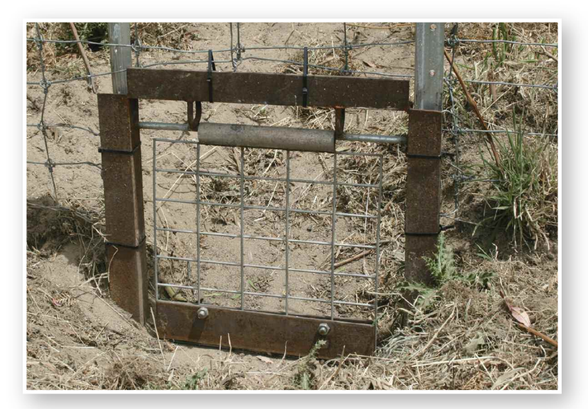
Effective wombat gate in fence, Mathinna

Ongoing maintenance is necessary, particularly during winter, to ensure the gates are neither blocked from opening or stuck open.