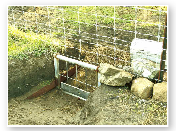
Wombat gate under fence mesh, Forestier Peninsula (Matt Dunbabin)

The gates must be placed where wombats have existing runways, rather than where it is convenient to place them. Therefore they must be put in place after the fence has been constructed and when the wombats have dug under it. Usually a gate has to be cut into a wallaby proof fence to allow it to be fitted at the correct height, however in light soils they are sometimes placed below the mesh as Matt Dunbabin has done on the Tasman Peninsula.