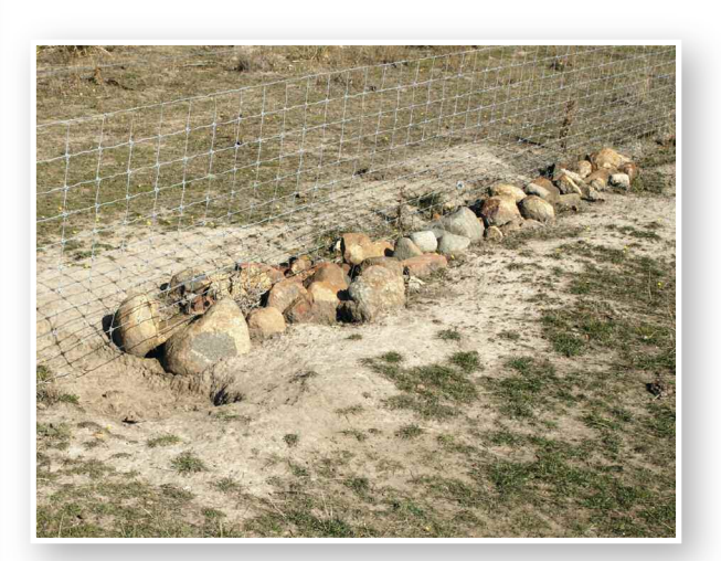
Numerous successive wombat holes blocked with rocks, Forestier Peninsula (Matt Dunbabin)